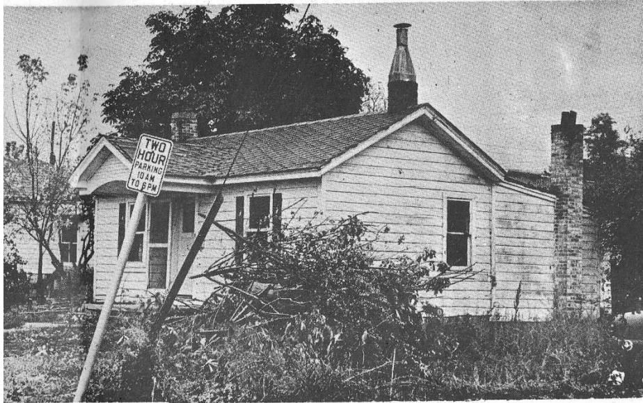
This is the old home before destruction work began last week end.