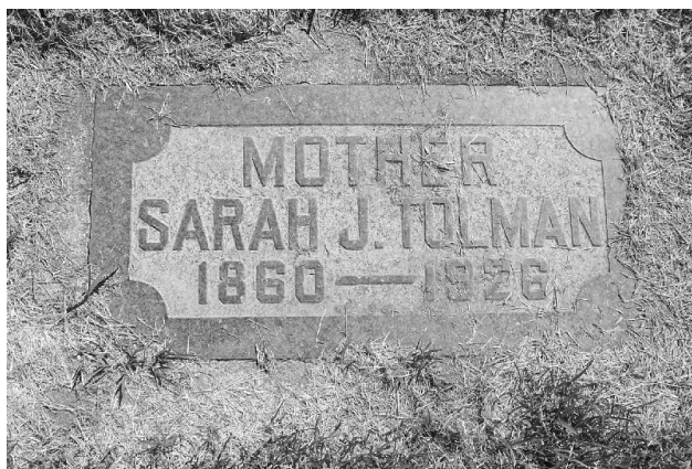
Headstones located in Bountiful Cemetery.